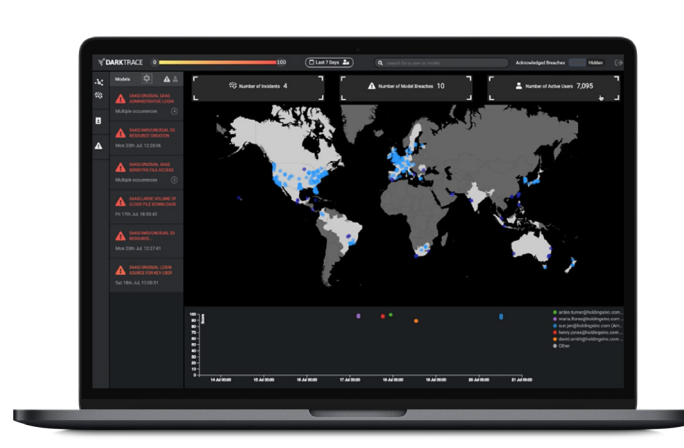
Figure 1: The Darktrace Immune System illuminates AWS environments

The Darktrace Immune System uses Cyber AI to learn normal 'patterns of life' for all users, technologies, and resources across the organization, enabling it to recognize the subtlest anomalies that point to an emerging threat.