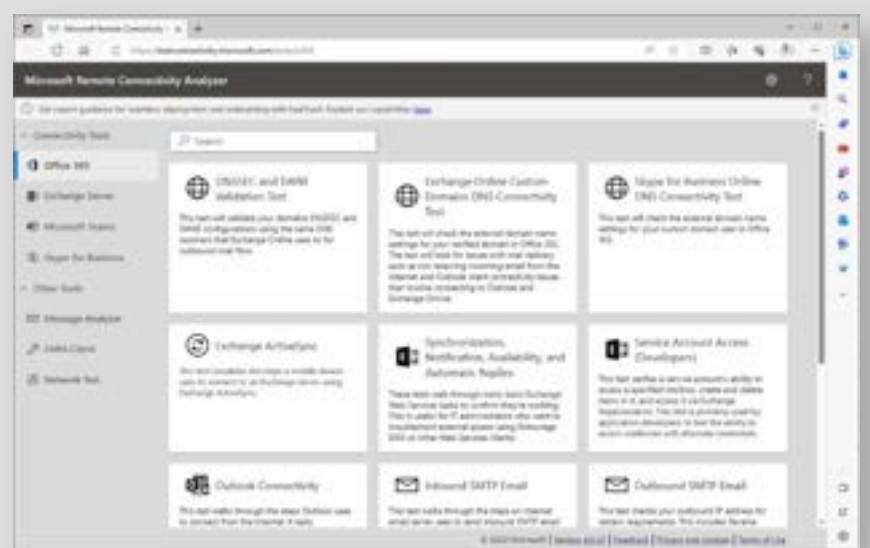
Remote Connectivity Analyzer

This tool simulates client logon and mail flow scenarios to assist with connectivity issues for on-premises Exchange, as well as Microsoft 365 and Teams, and can help when on-premises email is not set up quite right for an integration with M365.